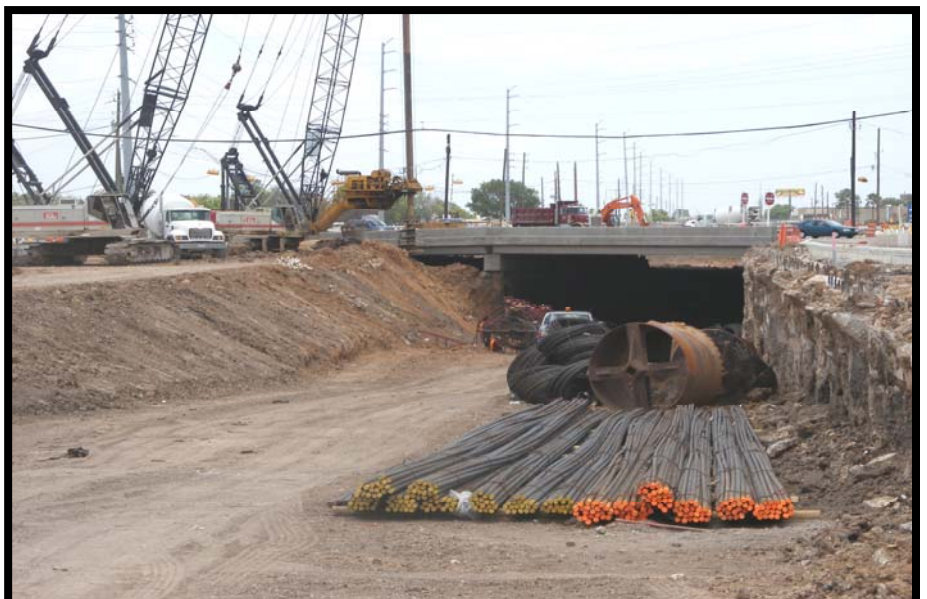
US 90A at FM 1092

Staffordians' patience and understanding with this elaborate construction process is proving to be worth the wait.