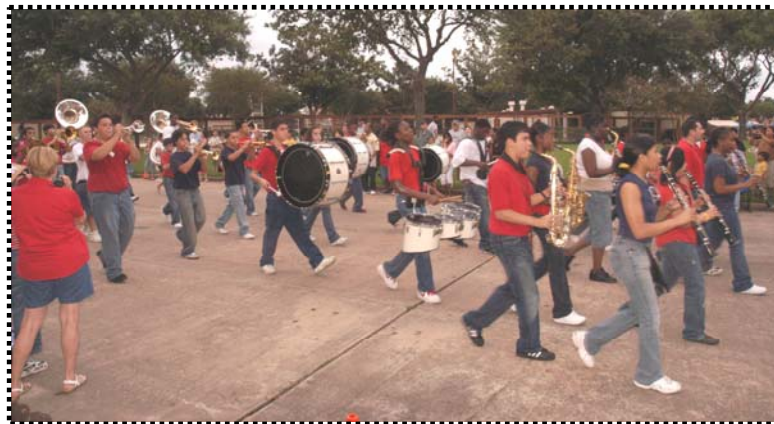
Stafford HS Band marches in July 2007 Parade

sponsor an Independence Day Celebration. The schedule of events, while resembling years past, promises to be even bigger and better.