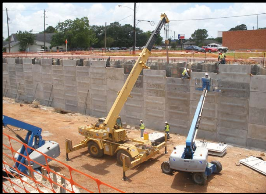
US 90A at Stafford Road

The $100 million US 90A Improvement Project, as it has become known, is finally rounding into shape. This endeavor has extended over nine years with meetings between the City, TxDOT, and Union Pacific Railroad, including planning, negotiations, execution of contracts, and ultimately the construction of improvements.