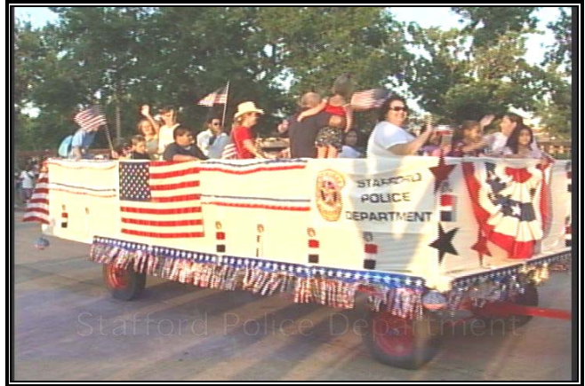
Scenes from 2009 Independence Day Parade

Stafford citizens will be looking forward to the activities associated with the Independence Day celebration, which will take place on Saturday, July 3, and Sunday, July 4. Watch for complete details in the July issue of The Stafford Newsletter .