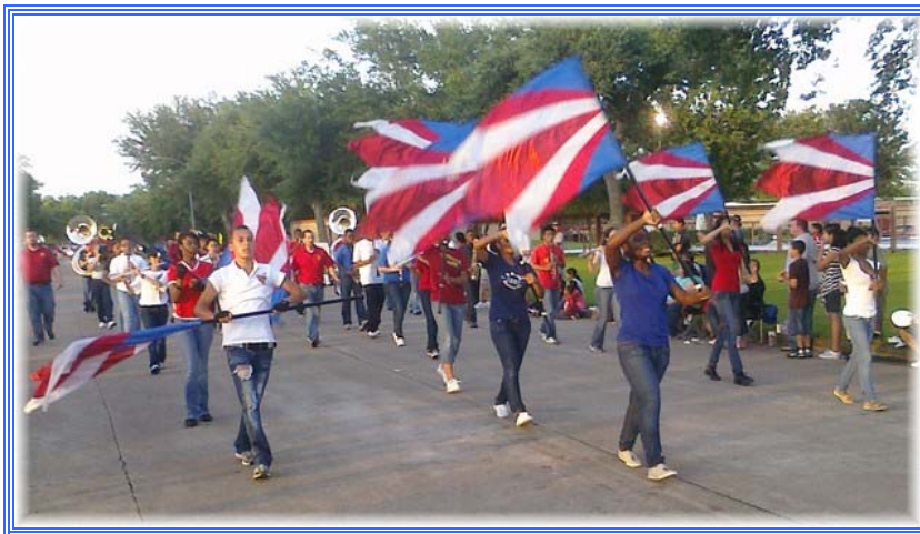
2010 Independence Day Parade

We encourage all Staffordians to come, enjoy and participate in this outstanding program offered by the City to its citizens and their guests.