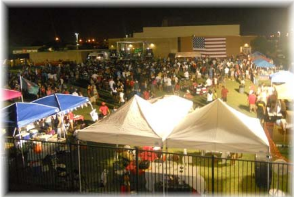
2011 Celebration on Festival Field at Stafford Centre

Last year, after 36 years, the Independence Day Celebration was moved to the Stafford Centre. In view of its overwhelming success and tremendous public acceptance, the Celebration will again be held there. Minor revisions have been made to enhance the festivities.