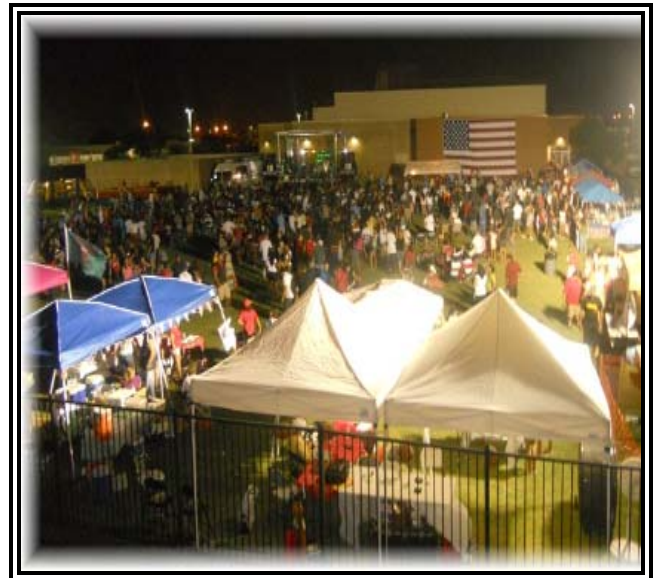
July 3, 2014 Celebration at Stafford Centre

The deadline for nominations for the Parade Marshal is April 30, 2015. The nomination form and instructions are located in the Hot Topics section of www.cityofstafford.com . If you have questions, please contact Susan Ricks at 281-208-6902.