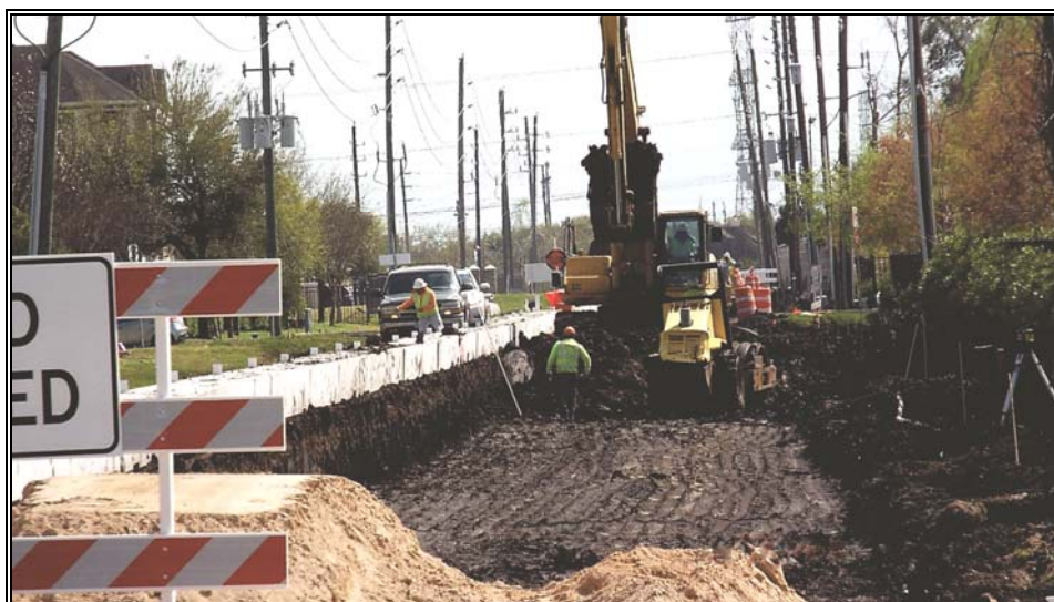
The major Brand Lane Street construction project within Stafford is being built with City funds totaling $2.24 million and without incurring any debt.